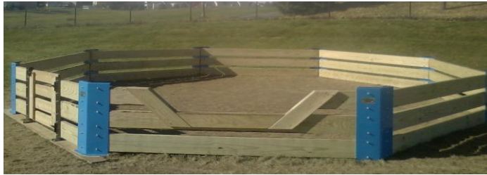
The students have been enjoying this new edition daily.